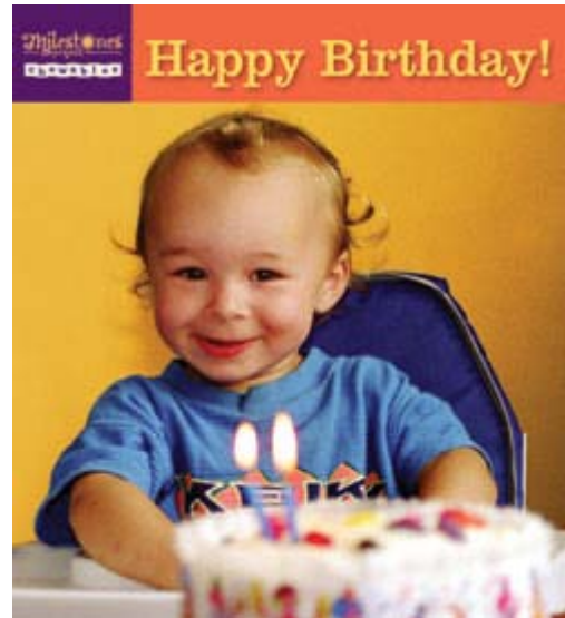
From Tricycle's new Chewables line.

© 2008, Reed Business Information, a division of Reed Elsevier Inc. All Rights Reserved.